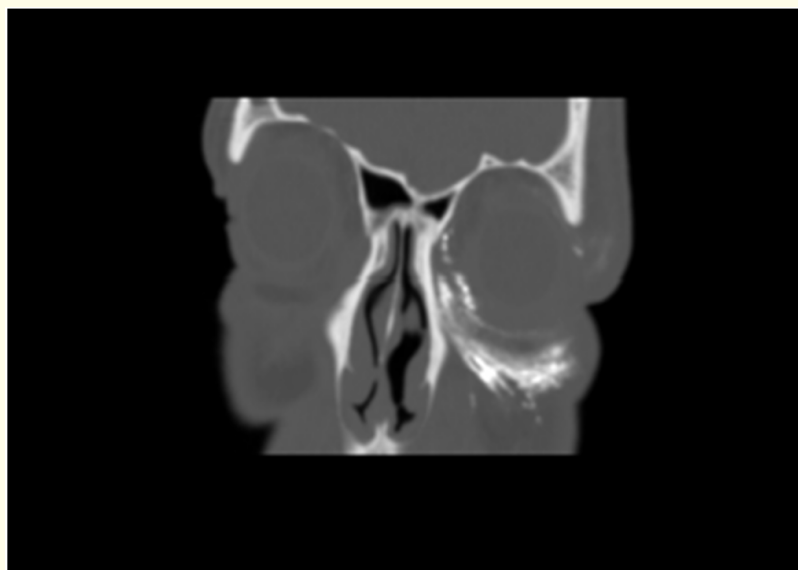
Figure 1: CT axial (1a) and coronal (1b) views demonstrating a left sided periocular hyperdense subcutaneous infiltration (white arrow). No evidence of post-septal involvement.